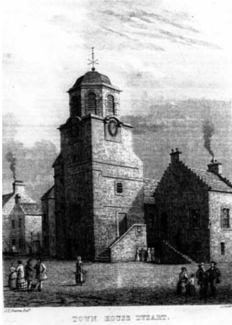
Town House Dysart